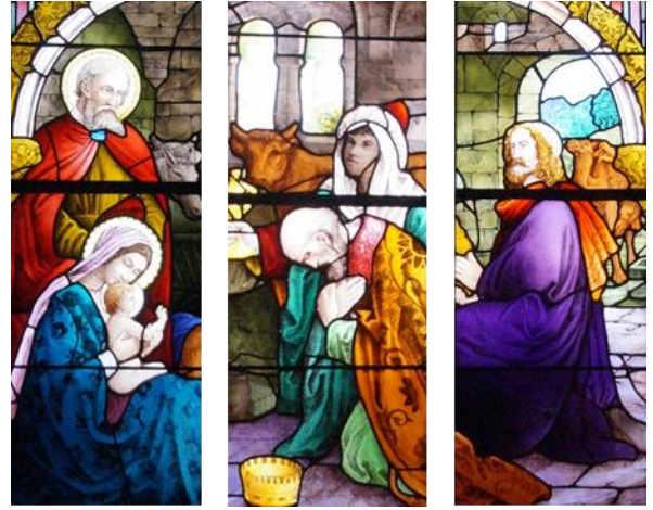
#2 Visit of the Kings