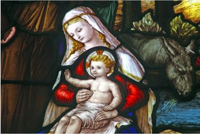
#1 Nativity Scene